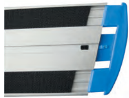
Replaceable strips design